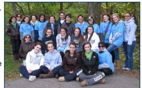
Mount St. Charles Academy Team

Please consider joining us for FRCA's 23rd Annual ShelterWalk on October 15th . Our next planning committee is being held on Tuesday, June 7th at 4:30 pm at FRCA, 245 Main Street Woonsocket.