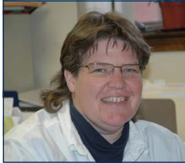
FRCA Child Welfare Director and permanency.”